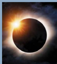
August 21st is coming. Are you ready?